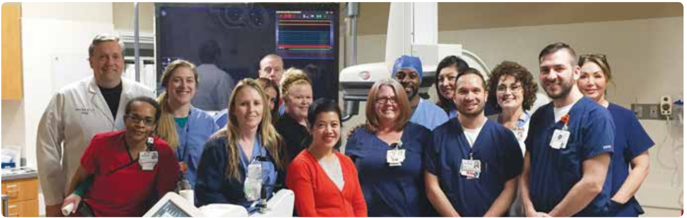
Members of the cardiology and emergency teams worked to help Methodist Charlton earn the Platinum Performance Achievement Award for the sixth year in a row.