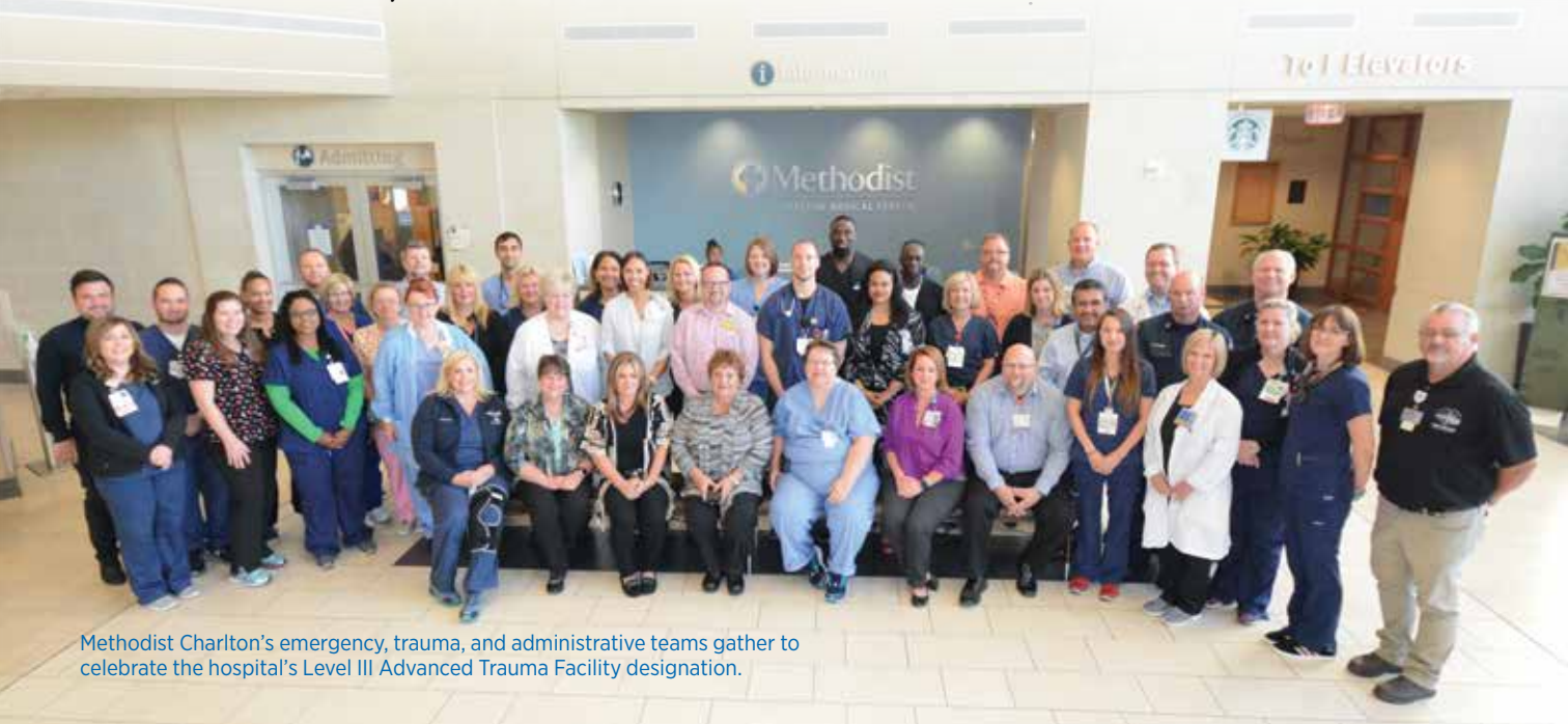
Methodist Charlton's emergency, trauma, and administrative teams gather to celebrate the hospital's Level III Advanced Trauma Facility designation.

Methodist Health System Foundation presented its 2018 Robert S. Folsom Leadership Award to Texas state Sen. Royce West. Since being elected to the seat in 1992, he has championed causes related to education at all levels and protecting at-risk youth. A formal dinner and celebration in his honor raised more than $1.6 million toward a new oncology unit at Methodist Charlton Medical Center.