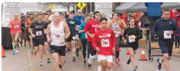
More than 1,000 people stepped out for heart health in the fifth annual Run With Heart on Saturday, Jan. 27, 2018, at Methodist Mansfield.