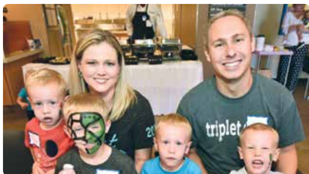
The Boughton triplets, shown here with their big brother, mom, and dad, were among many children at the hospital's NICU reunion in August. The hospital welcomed nearly 2,000 babies in 2018, with more than 175 benefiting from care in the NICU.