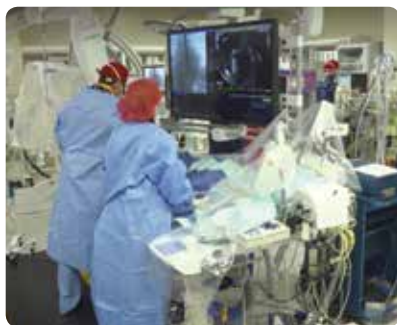
The TAVR procedure is minimally invasive and can be an alternative to open-heart surgery.

place a new valve. In Jim's case, the surgery took 15 minutes, and he was up and walking within hours.