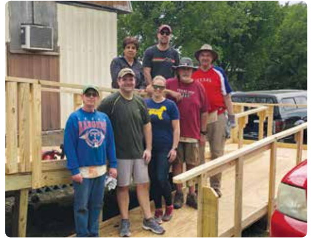
Methodist Richardson volunteers rolled up their sleeves to build a 50-foot ramp for a local resident with mobility challenges.