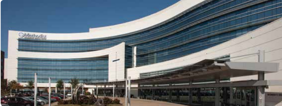
Methodist Richardson Medical Center