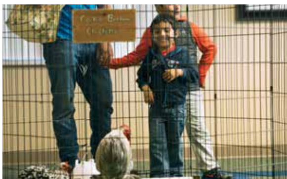
How to raise your own chickens for farm-fresh eggs was one of the many topics covered at the family-friendly Garden2Table event.