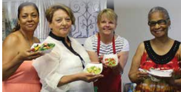
Methodist Generations hosted Eat Smart, an event featuring delicious ways to cook with nutrition in mind.