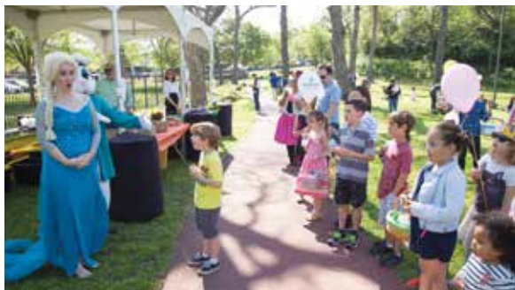
Frozen's Elsa enchants children at the Bunnies and Books event last spring. The event donated one book to every student at James S. Hogg Elementary School in Oak Cliff.