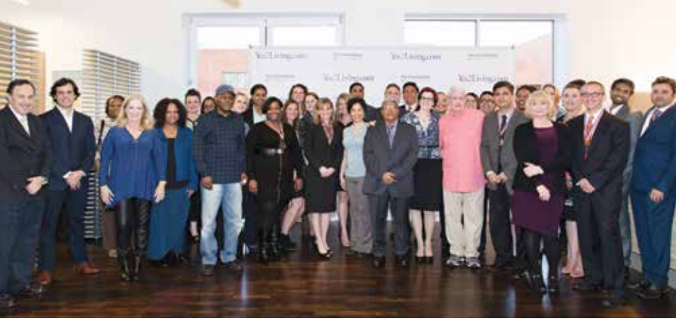
The transplant team celebrates its excellent outcomes at the Yes2Living survivor thank-you event on March 3, 2016, at Poggenpohl in the Dallas Design District.